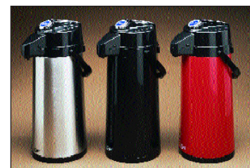
ThermoPro™ TLXA 2.2L Airpots. (Sold separately)

Standard and Large Gourmet Brew Cone for extra large throws.