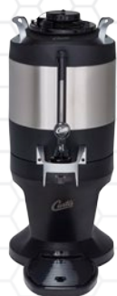
TXSG0101S600 1.0 Gallon with Sight Glass

Built-in Self Diagnostic System Energy Saving Mode